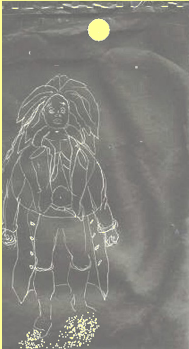
Insect emerges from the shadows like the spirit of Scrooge

"The small man answers to Insect," she advised as Insect squirmed away from Wong to stand beside her, gratitude in his eyes.